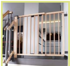
2738 + 0036ZK